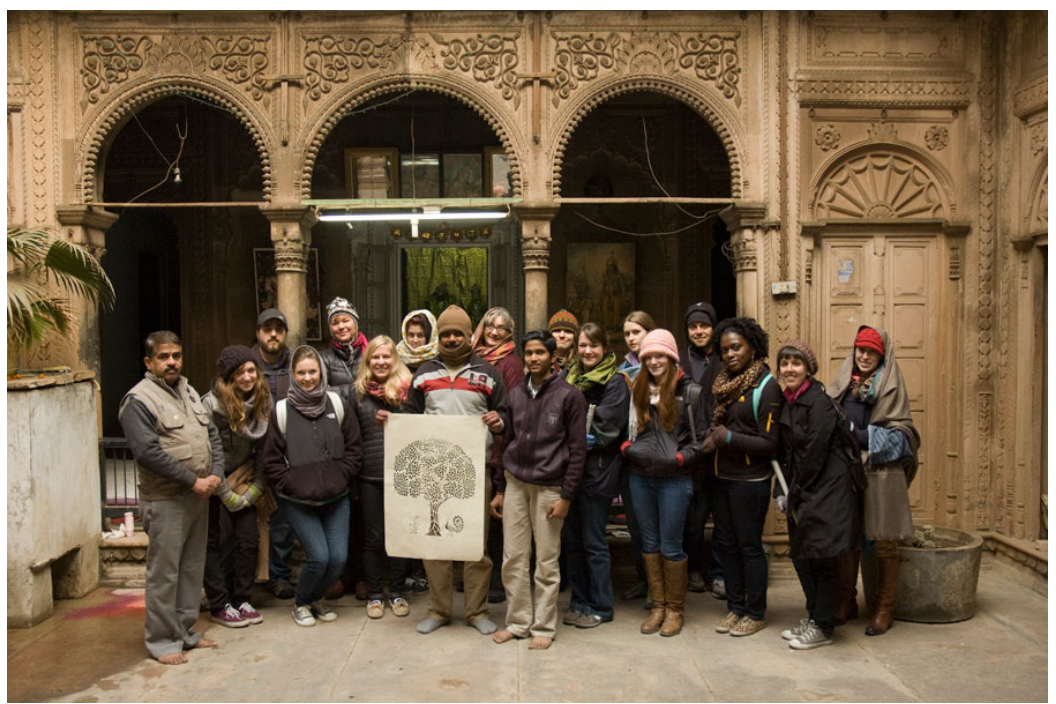
Winterim Students from the University of Iowa in Mathura

Tour Pace: Busy with time off to suit creative needs Available throughout the year, October to March preferred